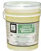
Clothesline Fresh® Chlorine Bleach 4